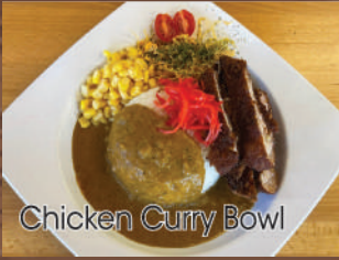
Chicken Curry Bowl