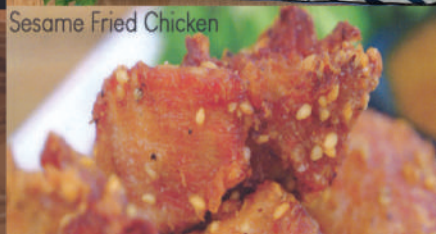
Sesame Fried Chicken