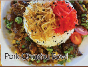
Pork Chashu Bowl