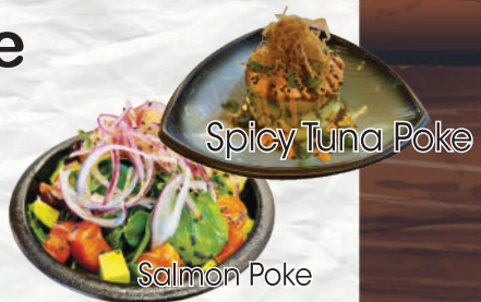
Spicy Tuna Poke