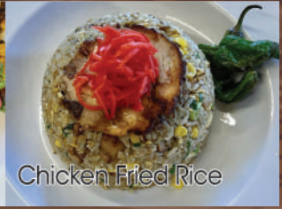
Chicken Fried Rice